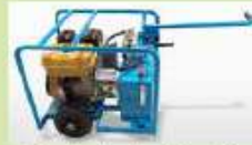
Engine hydraulic unit

► We are working on the development of original products. Small general purpose valve, Foot pump, Hydraulic unit