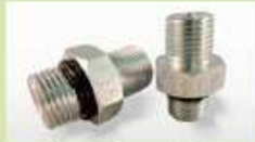
Slow return valve

► We design and manufacture hydraulic equipment for your company's requirements. Special valve/pump, Hydraulic equipment parts, Special hydraulic piping