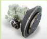
Direct coupling pump

We would like to realize what you wish you have.