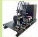
Motor hydraulic unit