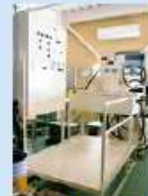
Hydraulic test stand