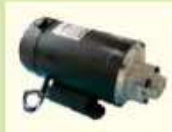
Motor pump assembly