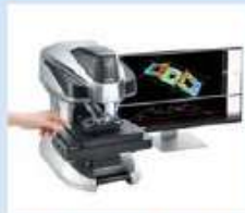
3D Measurement System

There are people, facilities and mechanisms for quality first.