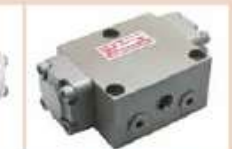
Flow divider valve

► We supply products and piping parts of hydraulic equipment from Japan and overseas.