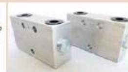
Pilot check valve