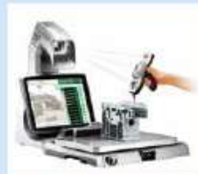
Handheld Probe Coordinate Measuring Machine