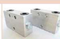
Pilot check valve