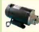
Motor pump assembly