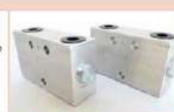
Pilot check valve