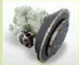
Direct coupling pump

We would like to realize what you wish you have.