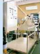
Hydraulic test stand