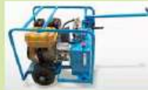
Engine hydraulic unit

▶ We are working on the development of original products.