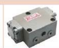
Flow divider valve

▶ We supply products and piping parts of hydraulic equipment from Japan and overseas.