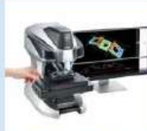
3D Measurement System

There are people, facilities and mechanisms for quality first.