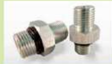
Slow return valve

Special valve/pump, Hydraulic equipment parts, Special hydraulic piping