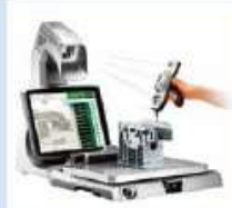
Handheld Probe Coordinate Measuring Machine